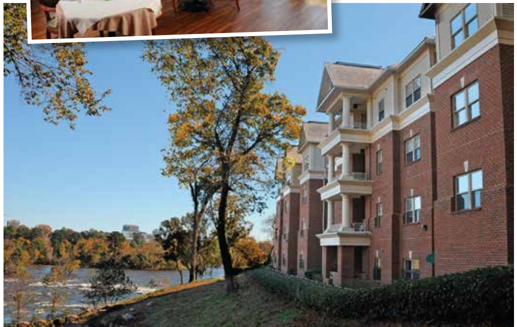
Below: The Laurel Crest Retirement Community in West Columbia overlooks the scenic convergence of the Three Rivers.