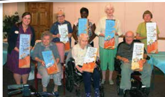
Above: Residents truly enjoyed painting in the Truth Be Told art class.