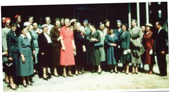
A group of Presbyterian Women visit the newly constructed Home.