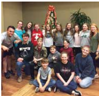
Mt. Hebron UMC Youth