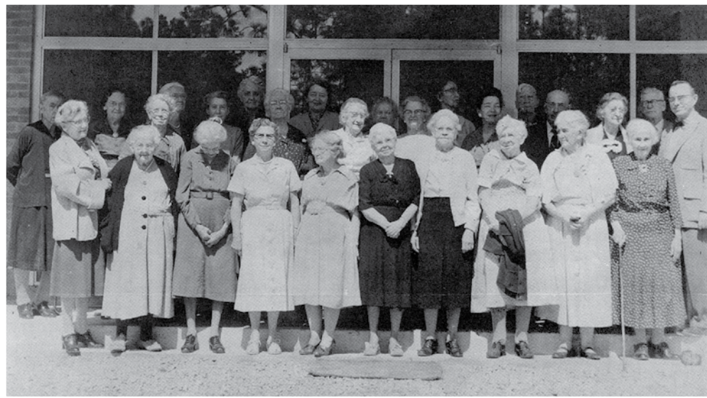
These "brave souls" were the first residents served by PCSC. They entered the Presbyterian Home in Summerville on January 12, 1958.