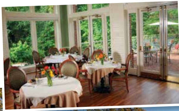
Left: The dining room and patio at Laurel Crest.