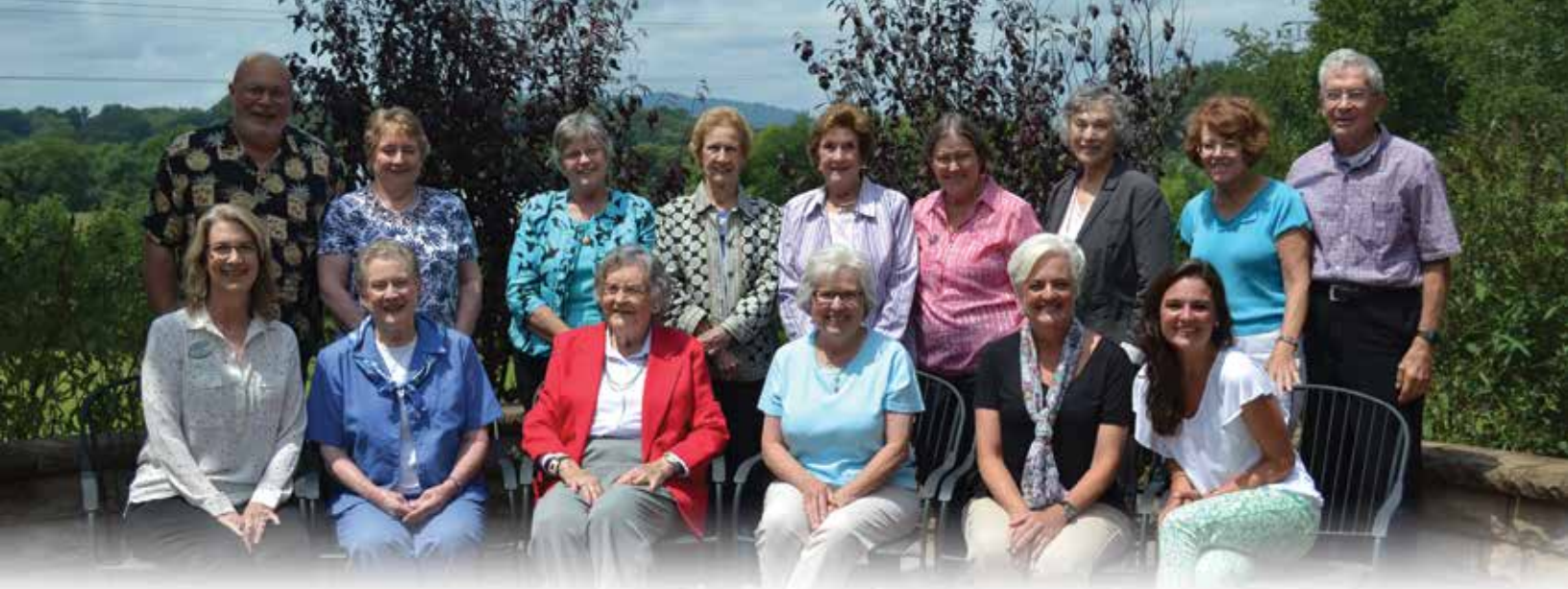
Above: Residents and staff enjoy a beautiful day before a show in Flat Rock.