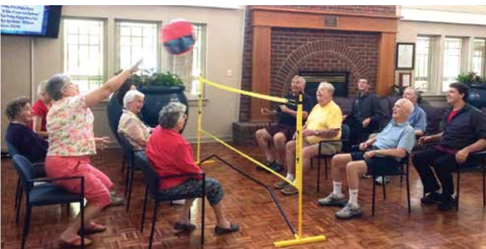
The chair volleyball competition heats up as it is guys vs. gals.