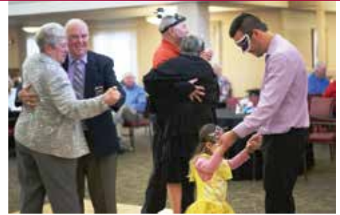
Above: Special memories being made at the Masquerade Ball.