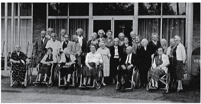
A group of Summerville residents in 1962.