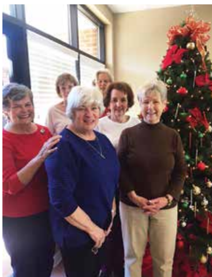
Seven Oaks Church