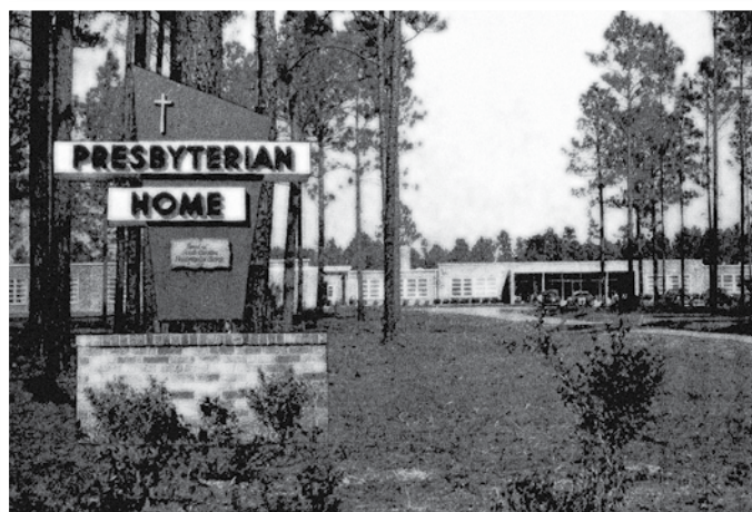
An early postcard showing the Presbyterian Home in Summerville.