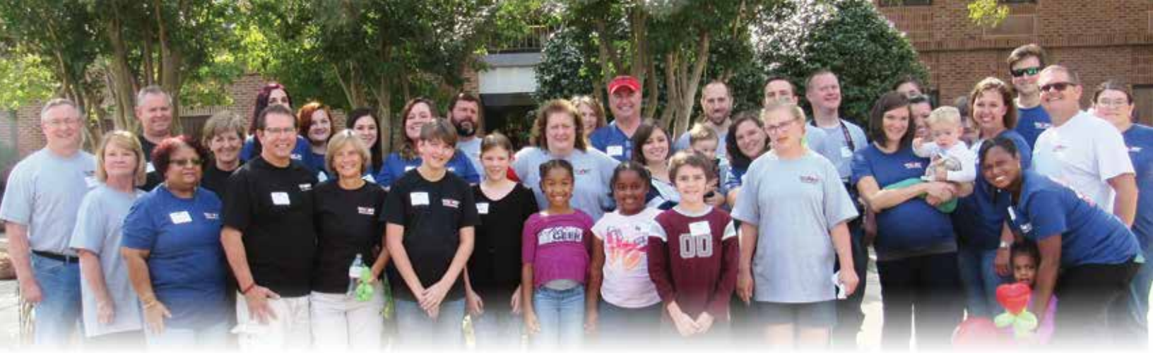
Above: A special thank you to the Southeastern Freight Lines Fall Festival Volunteers.