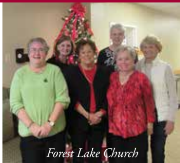
Forest Lake Church