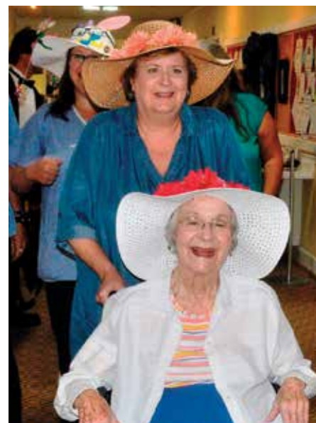
Celebrating Mother's Day at The Village.