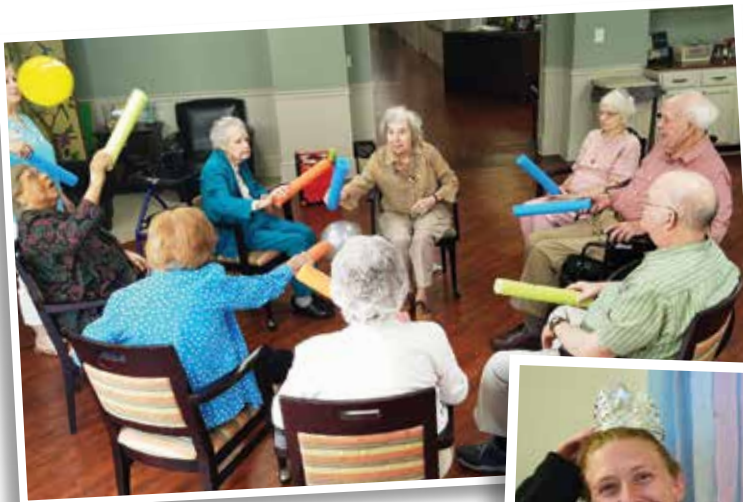
Above: Residents get into a challenging game of noodleball.