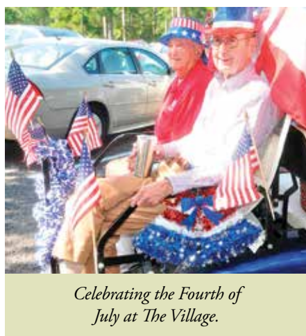
Celebrating the Fourth of July at The Village.