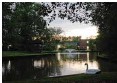
Dusk at The Village at Summerville.