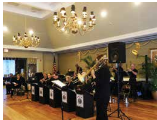
Above: The Capital City Big Band in action. Below: The Columbia Community dining room was lavishly decorated for the Spring Swing event.