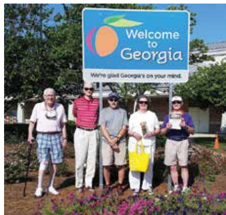
An excited groups of Foothills residents on the way to watch the Atlanta Braves take on the Chicago Cubs.