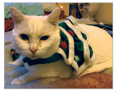
Angel outfitted as a Christmas tree