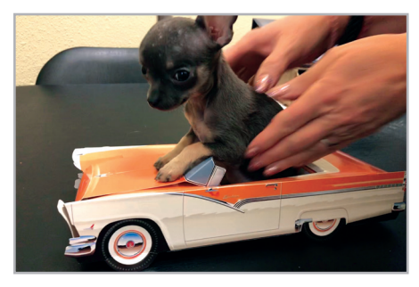
Welcome Penny Lane!