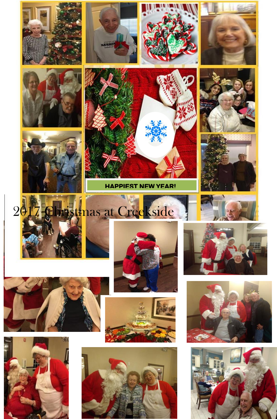
2017 Christmas at Creekside