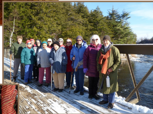
Right: Residents and guests joined the Will Rogers Outings Club for a trip to High Falls Gorge. It was sunny, cold and full of winter fun!