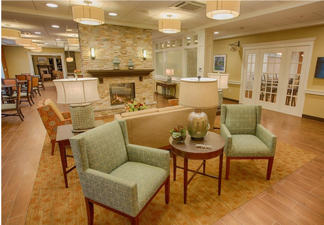
Comfortable sitting areas open opportunities for residents to connect with one another and their friends and family members.