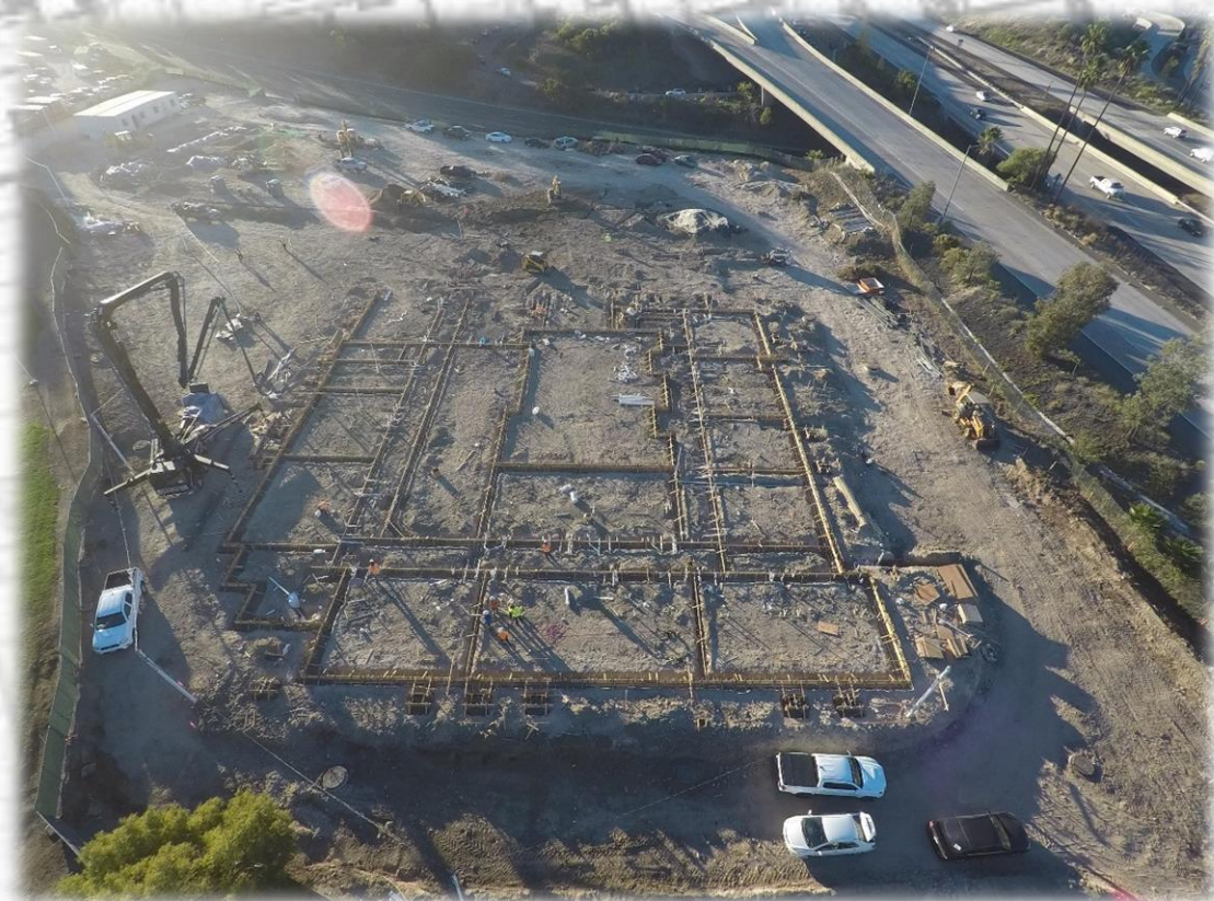
Preparing Concrete Boom Pump for Footing Pour