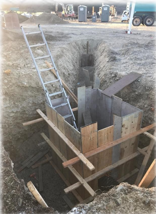
Storm Drain Boxes