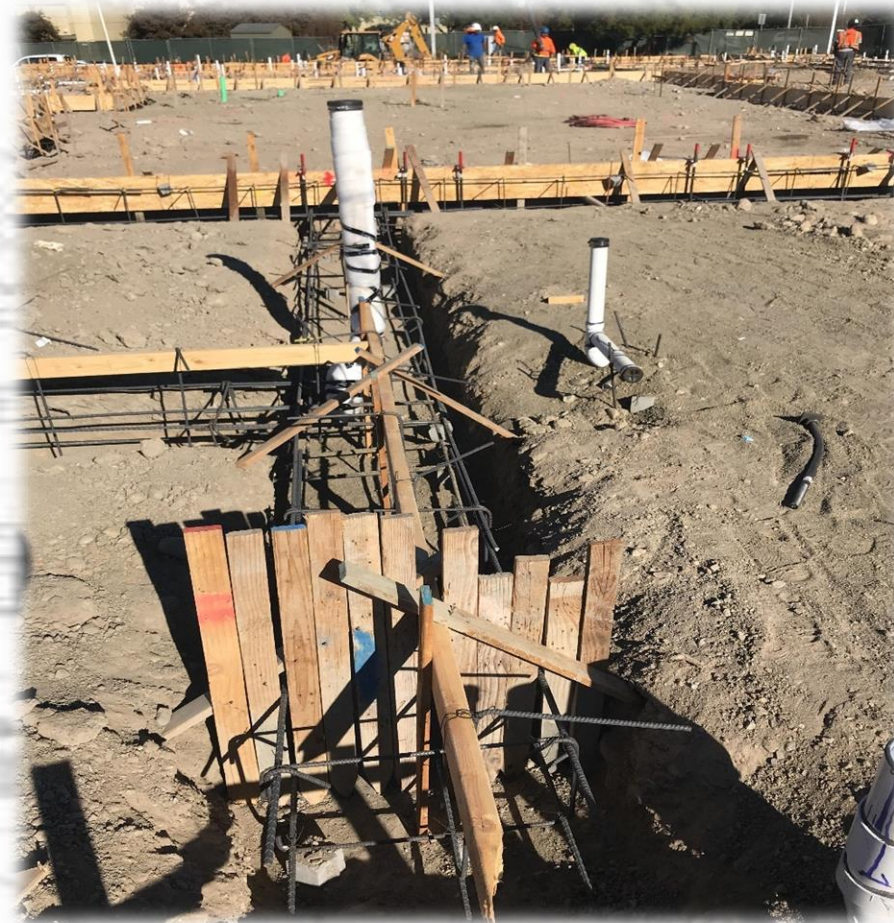
Footing and Rebar on East Side of Wing C