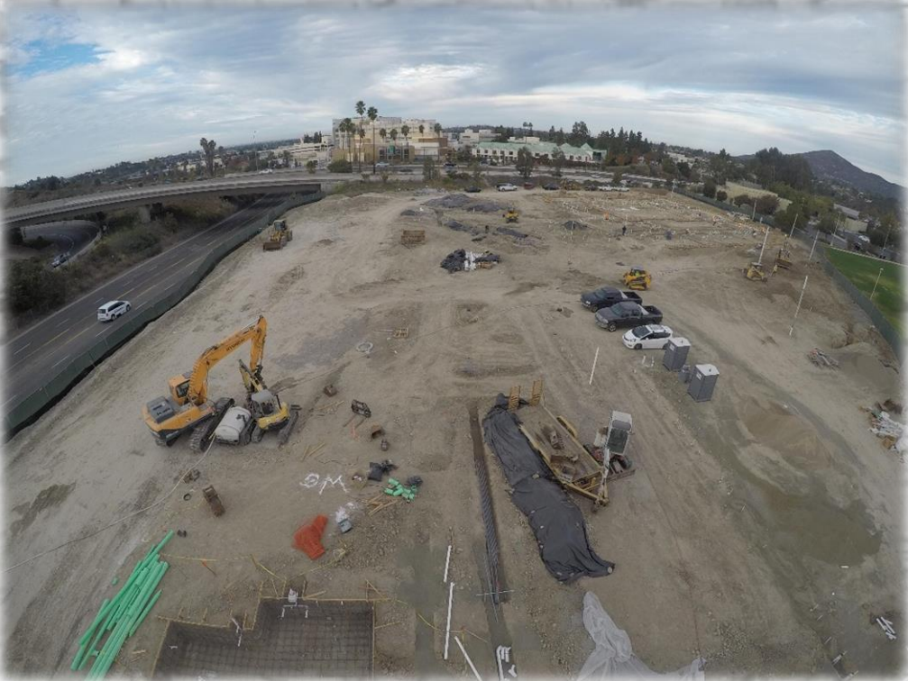
Project Oversight Facing Northwest