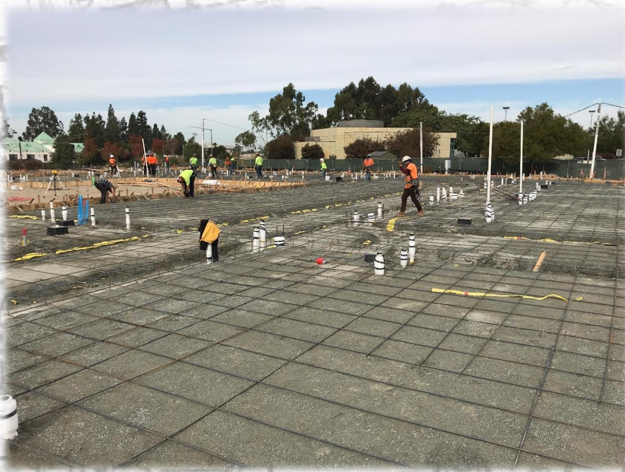
Reinforcing Steel for Slab on Grade