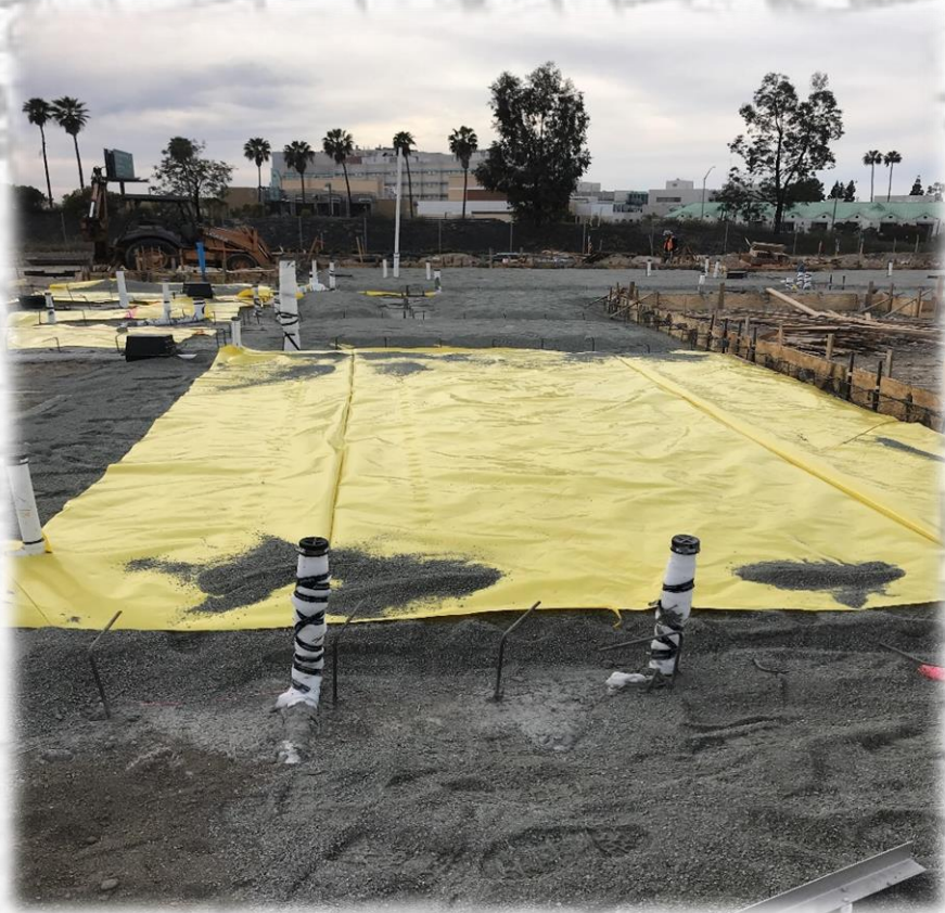
Vapor Barrier at Wing C