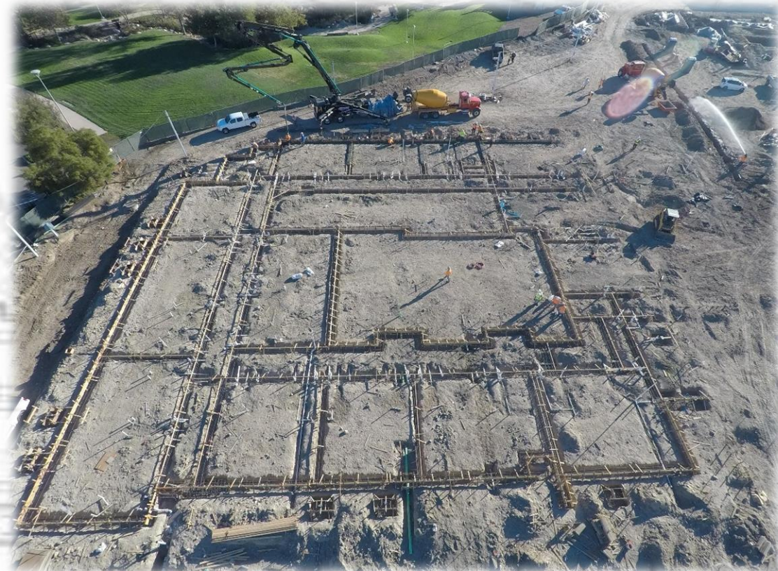
First Concrete Truck for Footing Pour