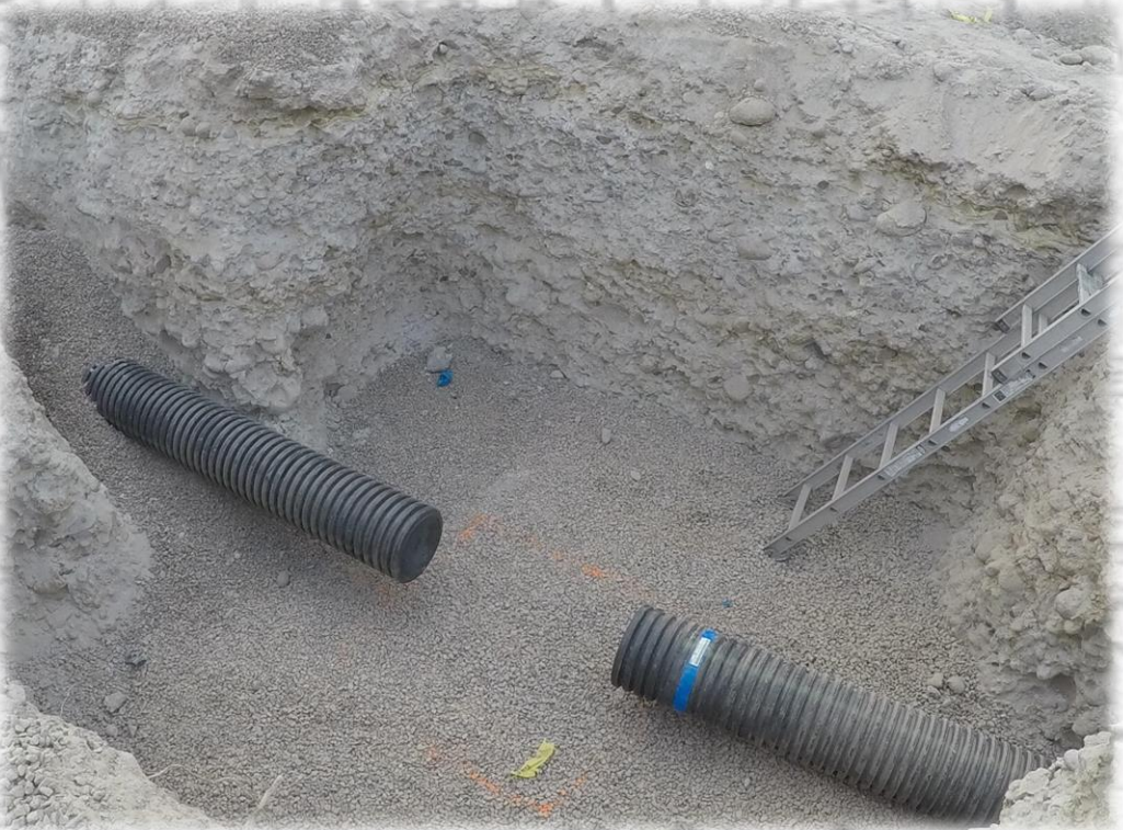
Storm Drain Piping