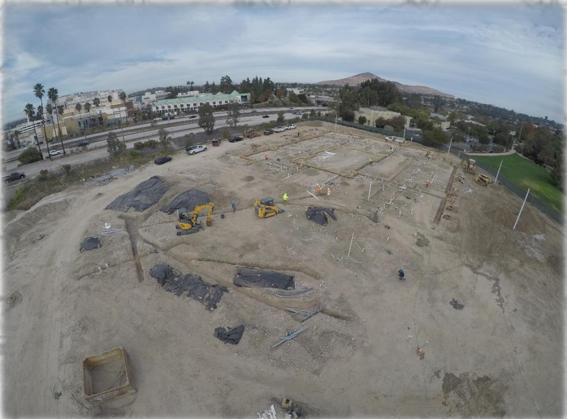
Electrical Trenching in Core and Form Boards at Wing C