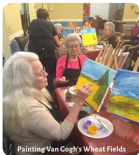
Painting Van Gogh's Wheat Fields