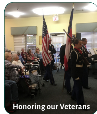
Honoring our Veterans

As we prepare to say goodbye to 2017, we pause to reflect on the blessings this year has held. We have made many new friends, said goodbye to some, and made special memories together as we shared in one another's joys and sorrows. In November we honored our Veterans and came together to give thanks for each other, and for our faithful volunteers. As we begin seeing Christmas decorations, and look ahead to a calendar filled with singing, parties and special outings, let's remember to slow down and reflect upon that first Christmas so long ago, and the joyous message that it proclaimed. Our Merryvale family wishes you a blessed and Merry Christmas and a Happy New Year!