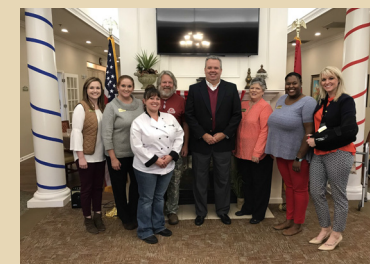
The Lantern at Morning Pointe of Clinton Team