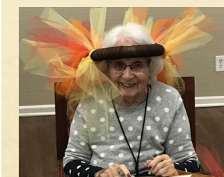
Ethel Turkey Wreath