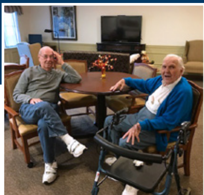
Some of the guys just hanging out