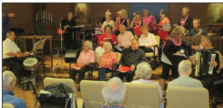
Above: The Silverado Chorale sang for residents