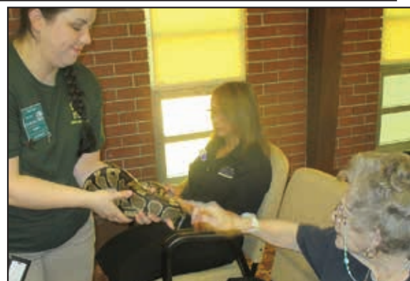
Right: A visit by the Denver Zoo community outreach brought snakes for residents to see and learn about.