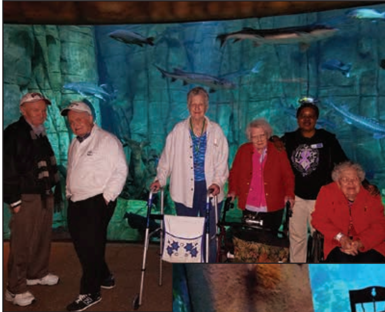
Above and right: Assisted Living and memory care took an excursion to the Downtown Denver Aquarium to see the fishes.