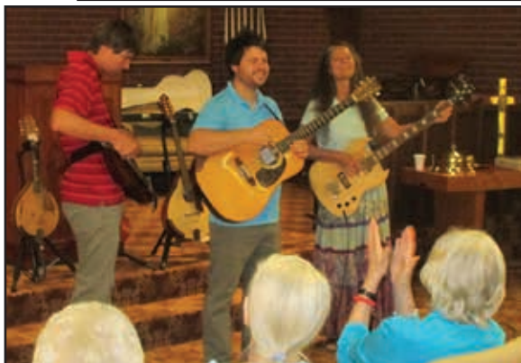
Above: The Rowe Family Band.