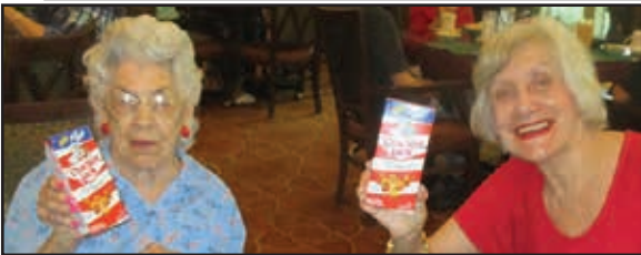
Left and below: National Cracker Jack Day