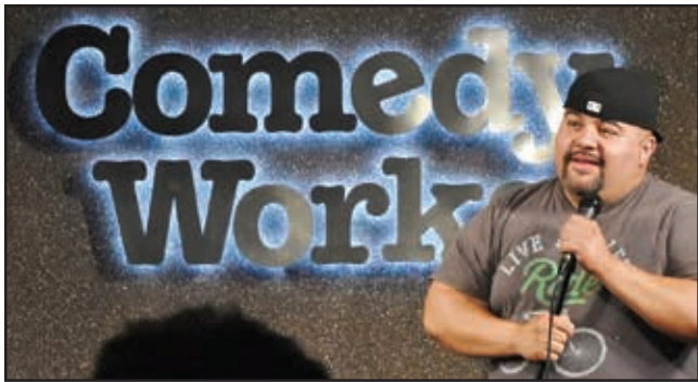
Summer Time Fun time at Comedy Works for ESMRC's annual Evening of Laughter