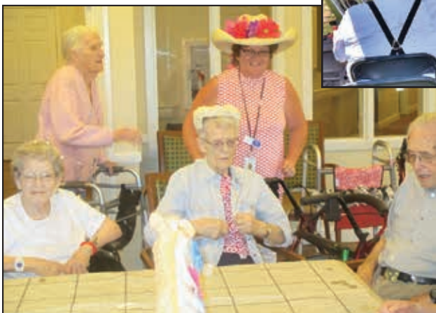
Above: The Kentucky Derby was celebrated with a horse racing event and Hat Party.