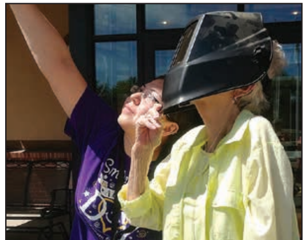
Below: Watching the eclipse on Aug. 21

The Robert Russell Eastern Star Masonic retirement Campus is a 501 (c) 3 non-profit, so all donations are tax deductible. Please make checks payable to Robert Russell Eastern Star Masonic Retirement Campus or R.R.E.S.M.R.C. Send them to Attention Director, 2445 S. Quebec St, Denver, CO 80231.