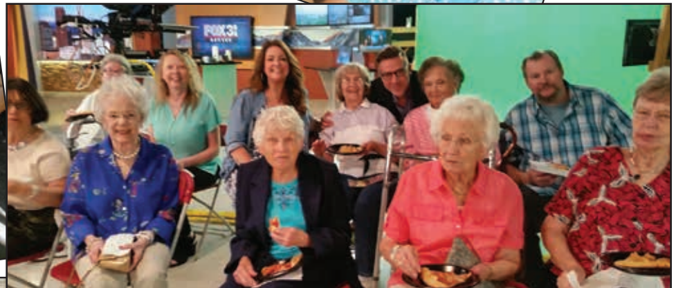
Above: A field trip to "Good Day Colorado" for a live taping of their show. During that show, ESMRC guests were mentioned seven times on air.