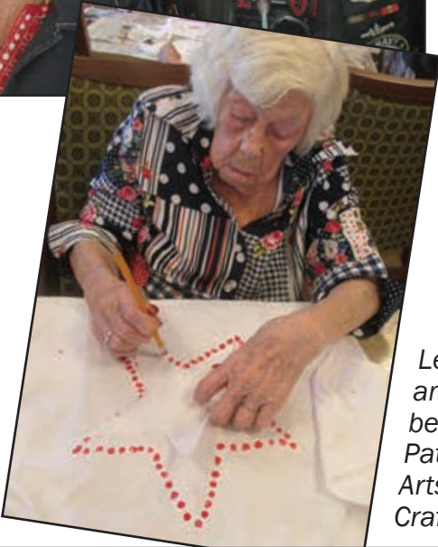
Left and below: Patriotic Arts & Crafts