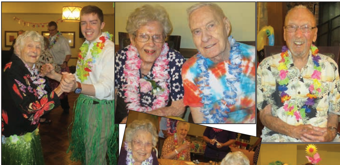
The Colorado Masonic youth: DeMolay, Jobs Daughters and Rainbow Girls hosted the annual senior prom for all residents to enjoy, complete with conga line (below).