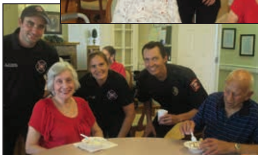
Fire Station #22 enjoyed an ice cream party at ESMRC in their honor.