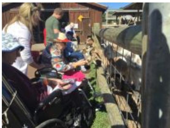
Lewis' Petting Zoo

November is a month of gratitude for all the little things we have each day. Each moment in our lives is connected to another. Some moments will come and go and be lost, but we have the ability to enhance those moments. Thanksgiving brings family memories, the smell of freshly baked meals and sounds spiritual gatherings.