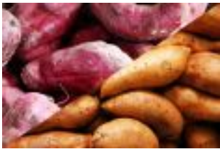
yams or sweet potatoes

Although these two root vegetables resemble each other, they are unrelated plant species. Yams are native to Africa and Asia, are cylindrical in shape, and have a tough skin and dry, starchy flesh. Sweet potatoes have tapered ends, smooth skin, and flesh that is moist and sweet. In the U.S., true yams are hard to find, and those labeled as yams are typically a variety of sweet potato with copper skin and deep-orange flesh.