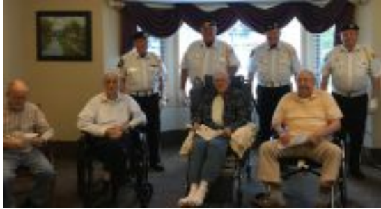
Our residents at the ceremony