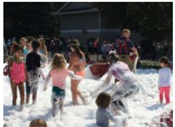
The grands in the foam just having a ball.