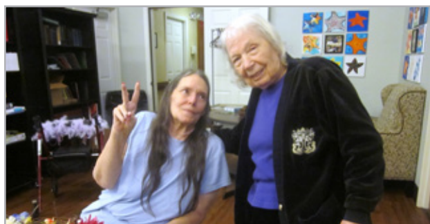
Peace and Love.