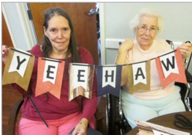
Yeehaw! Western Days!