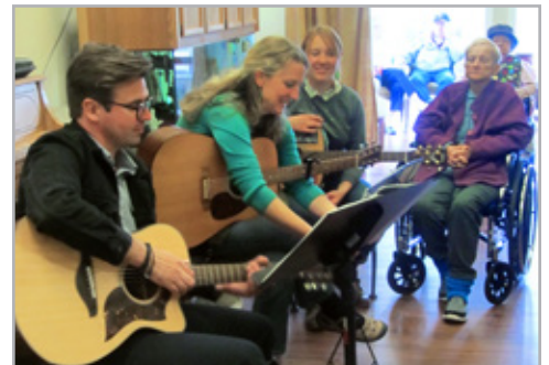
Another great performance!