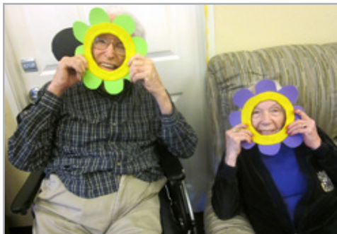
So happy together!