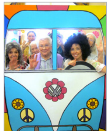
All aboard the happy bus!