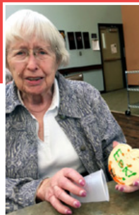
Time to bake and decorate for Halloween!