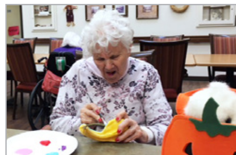
More baking and decorating for Halloween!