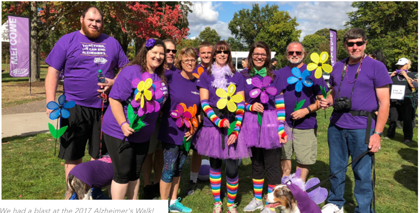
We had a blast at the 2017 Alzheimer's Walk!