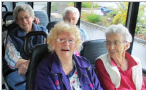
These are some of our lovely ladies going on a scenic drive.