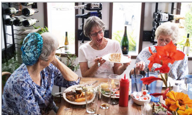
◀ ▲ We do LOVE our desserts!