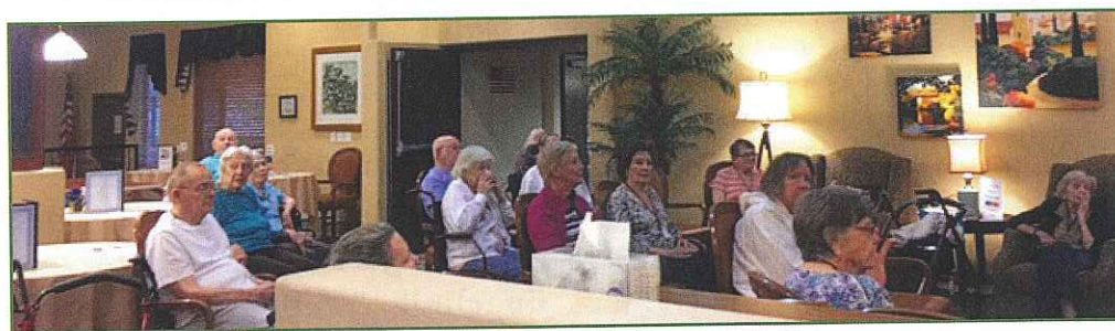
Residents were busy watching Total Eclipse Live Streaming on August 21, 2017.