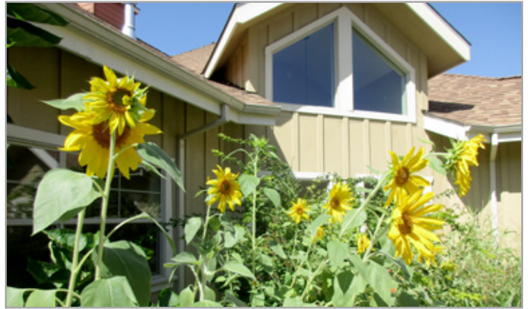
Wow! Our sunflowers really took off!