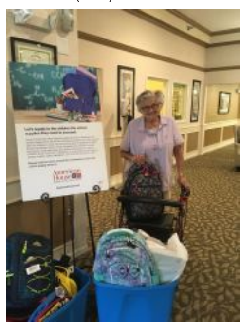
THANK YOU to everyone who donated school supplies. They were donated to Willow Woods Elementary School.

Let's go to the DIA! Thursday, October 5th, depart after breakfast (9:30).