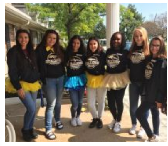
Sterling Heights High School Cheerleaders did face painting and played games with the youngsters.