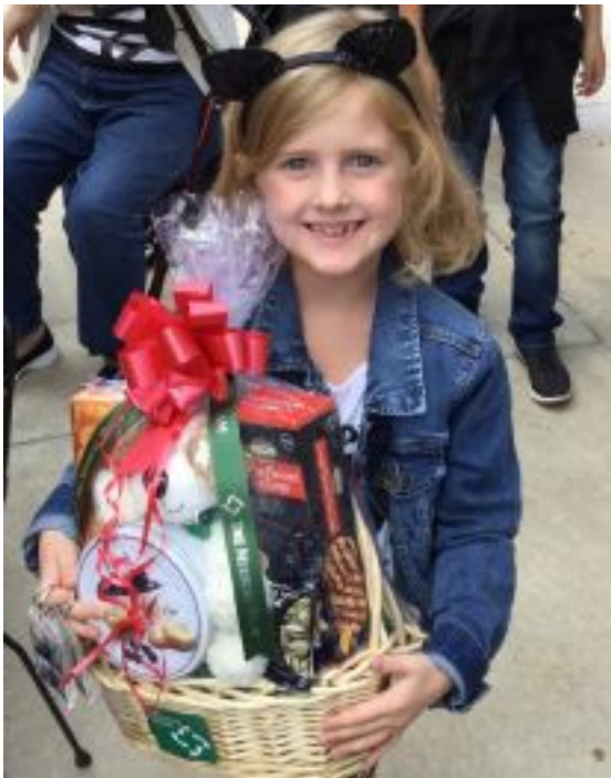
Big winners bring big smiles.