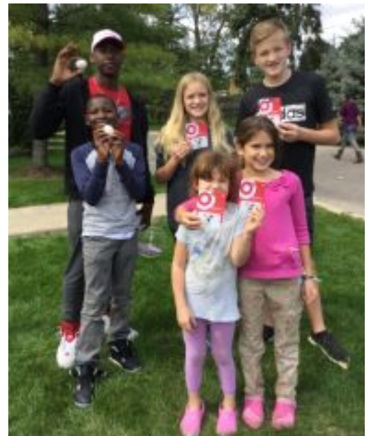
Oh yeah, check out our egg toss winners!