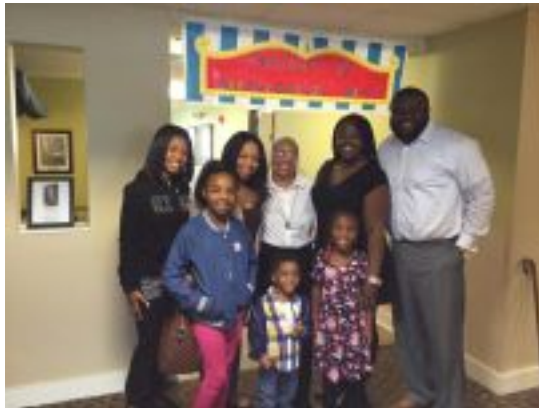
Heath Family in full force at Grandparents day.