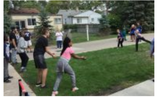
What fun we had at the egg toss.