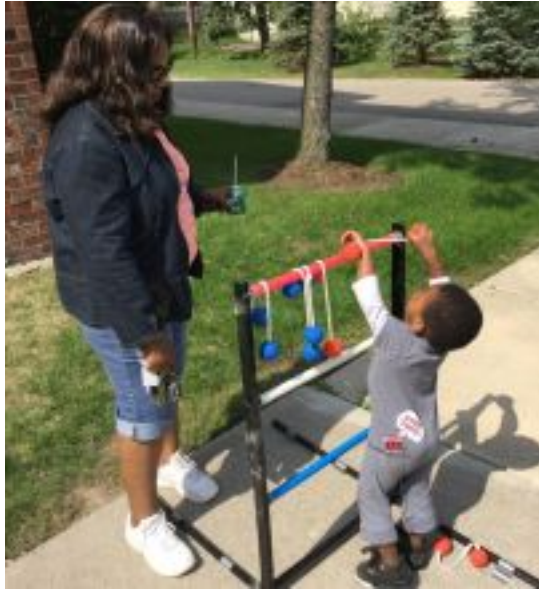
Grandma, I can do this.

Come join us Tuesday, October 10th, at 9:30am in our Game Room with all your questions for a Pharmacist.