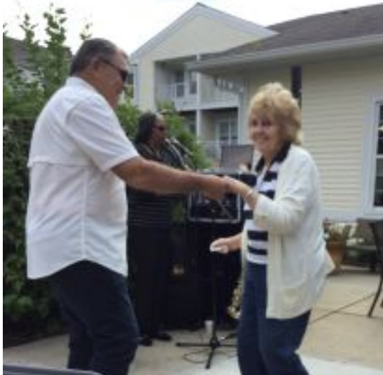
Dancing keeps the heart young.