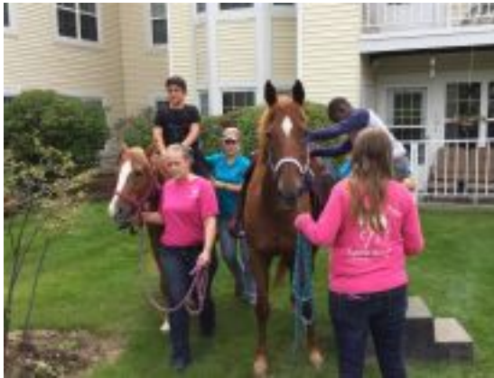
What a Hit with our Pony rides. Thank You, Day Dreams Farm.