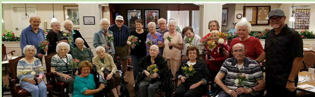
Family Is Forever