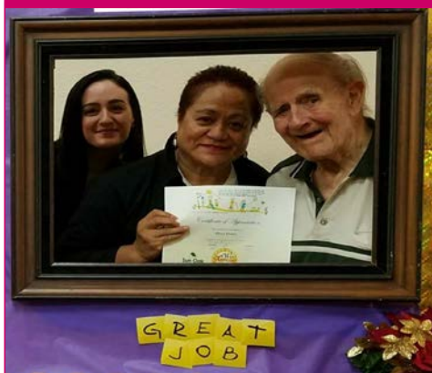
"Like Family" Award