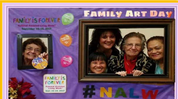
Family Art Day