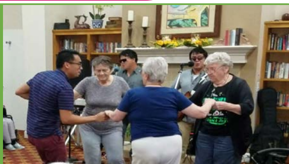
Music brings Family Together