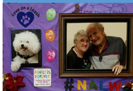
Pet makes our family complete