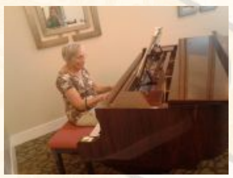
ALOHA From Our Hawaiian Dinner