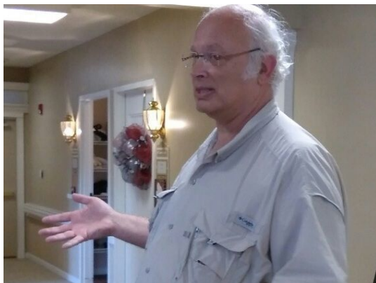
Solar Eclipse Learning about Safety