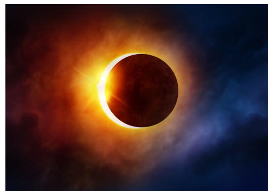
We Witnessed a A Rare Celestial Event

We enjoyed viewing this once in a lifetime event and learning all of the ins and outs of viewing the spectacle safely. What a sight it was for our residents!