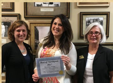
Celebrating Excellence in the Community

It's Walk Season! We would LOVE to have your participation as part of our Morning Pointe Team for either the Breast Cancer Walk on Saturday, October 7th or the Alzheimer's Association Walk on Saturday, November 11th. We are still raising money for both causes. We encourage you, your family and friends to join us in raising awareness and finding a cure for these diseases. Let us know if you have any questions or would like information. We look forward to adding value to our community.