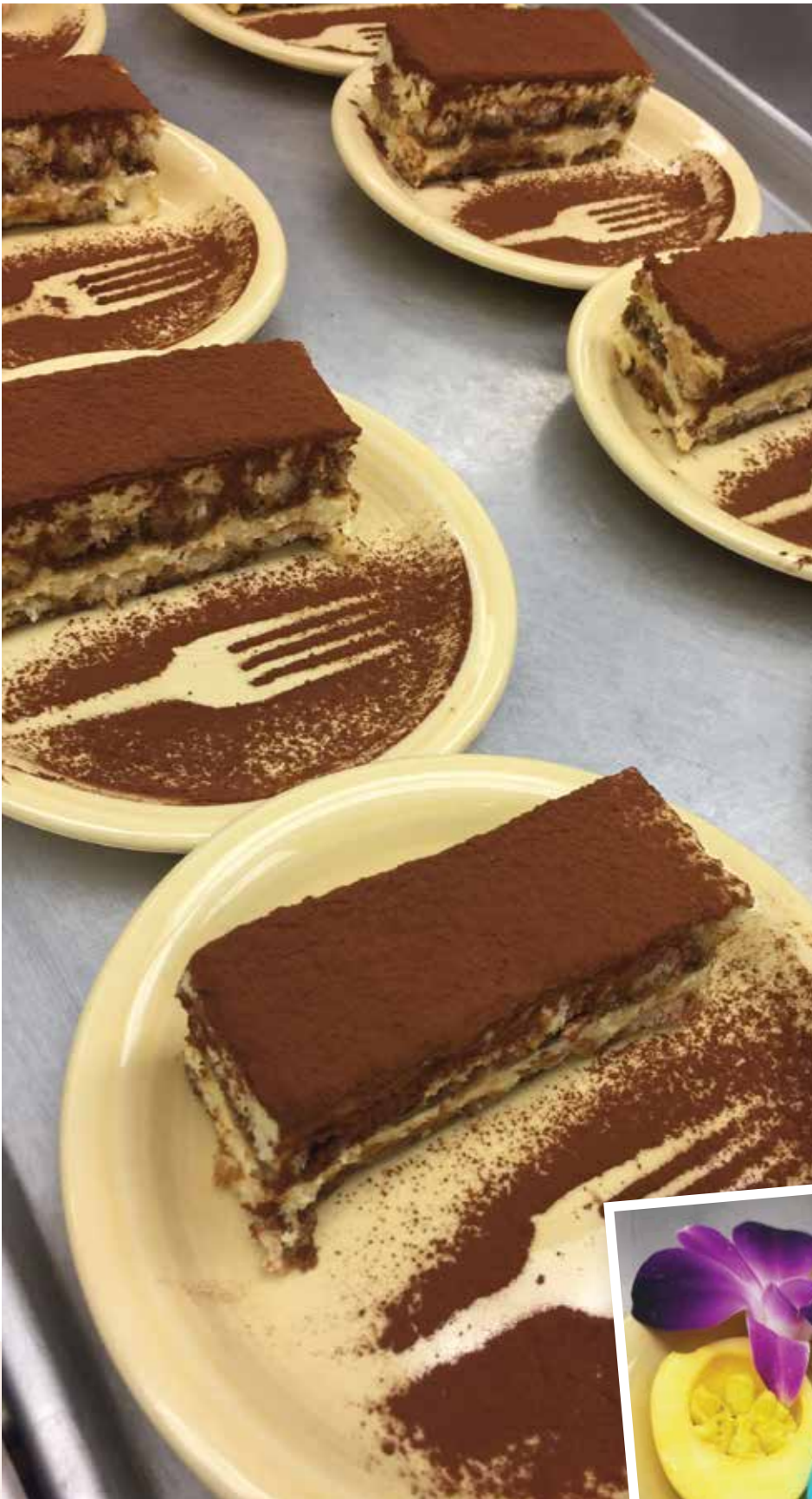
Cesar's creative take on Tiramisu!