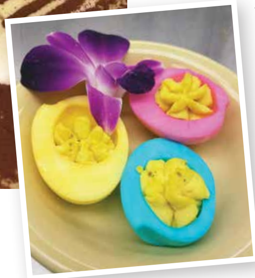
Deviled Eggs made by the Culinary Team for Easter brunch.

By making a special effort to make food both tasty and beautiful, they leave a dusting of gratitude and joy with every meal.