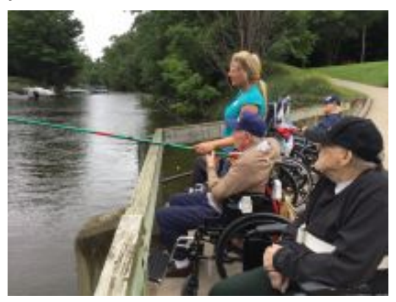
Fishing at Lake Harbor Park

Our residents will enjoy a trip to the Hemlock Crossing on September 28th to see a special programs on fall birds and Michigan wildlife. September is a new beginning for most of us who had to return to school and start another year of life's lessons.